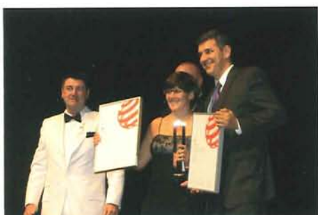
below at the red dot awards night